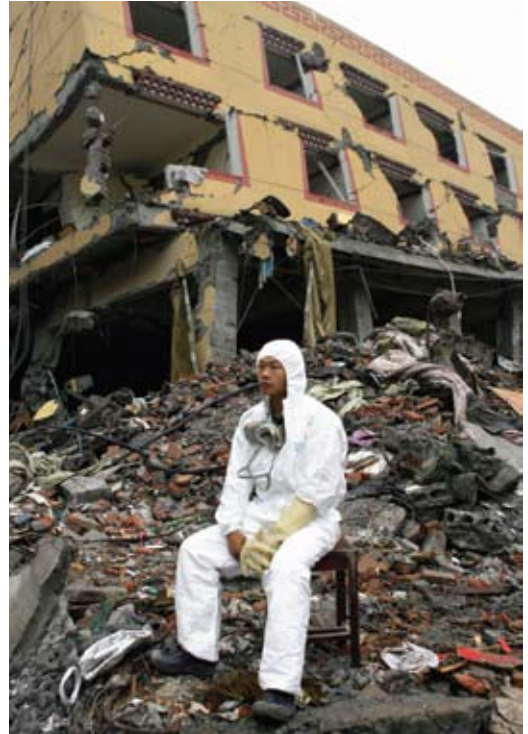
Above An epidemic prevention soldier waits to transport dead bodies in front of the debris of destroyed homes in Yingxiu Township, in Wenchuan County of Sichuan Province, China. More than 68,000 people are now known to have died in the quake and Chinese aid workers are struggling to find shelter for millions who have lost their homes.

preservation of human life above all else won praise at home and abroad.