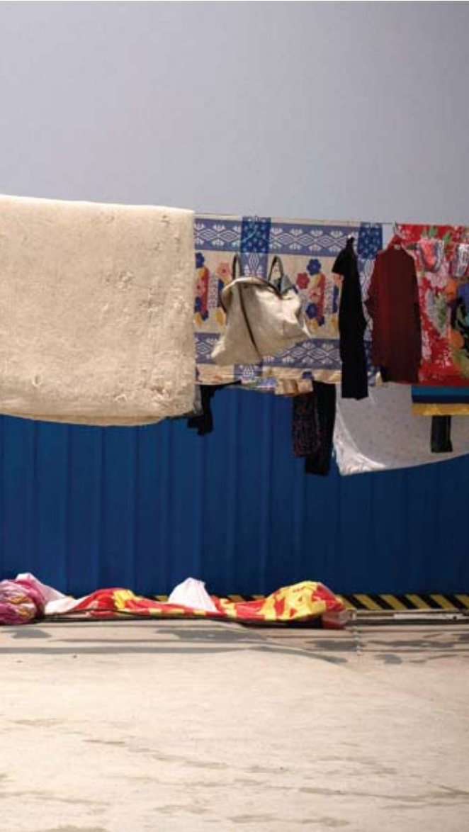
Left An elderly woman hangs her laundry at a temporary housing area built for the earthquake survivors in Dujiangyan, Sichuan Province, China. Amidst the devastation, even the most mundane aspects of life must go on.