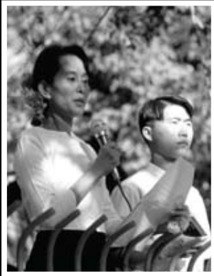
Aung San Suu Kyi delivering an address from the gate of her home in 1996, where she remains under house arrest

The Burmese military has created a parallel state-within-a-state, a society where army personnel, their families and dependants enjoy a position far more privileged than their counterparts ever had in, for instance, Thailand and Indonesia.